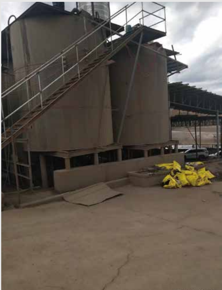
Gold Mine in Yunnan