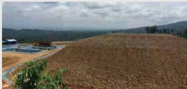
Gold Mine in Zimbabwe