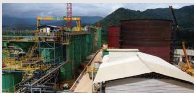
Gold Mine in Xinjiang