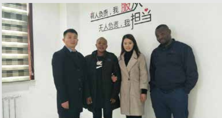
Customer in Zimbabwe