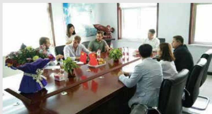
Customer in Russia