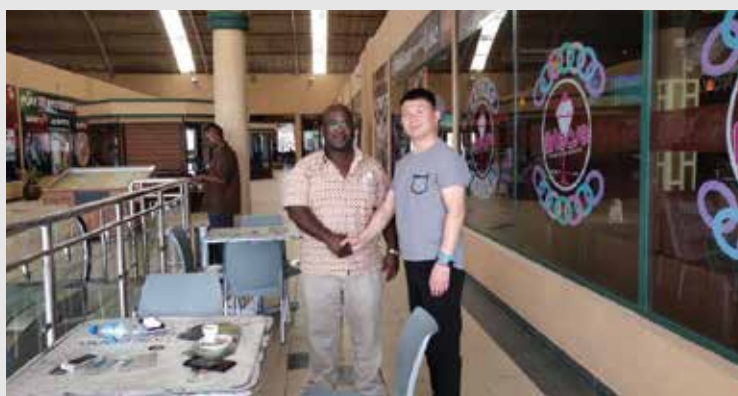
Customer in Tanzania