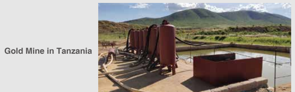
Gold Mine in Tanzania