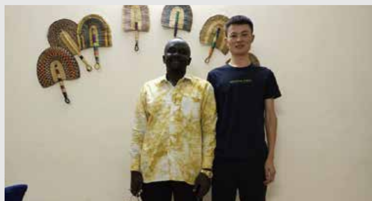
Customer in Burkina Faso